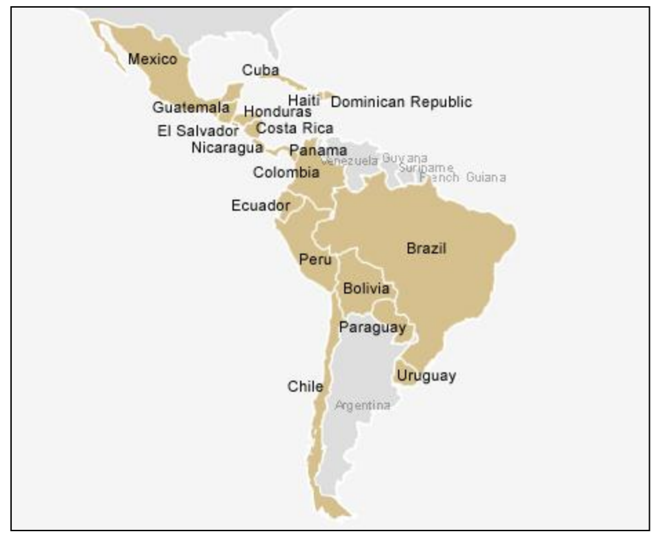
Latin American countries with active Joint Programmes as part of the MDG-F thematic window on Democratic Economic Governance

Out of the 11 countries that are part of the DEG thematic window, seven are located in Latin America, two in Europe, one in Asia and one in Africa: